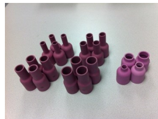
(25) x1 #6 77700530 x1 #8 77700532 x1 #10 77700533 x1 #12 77700534 (26) x4 #6L 77700570 x4 #8L 77700571 x4 #10L 77700572 x4 #12L 77700574