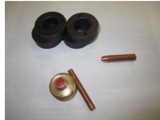
Part Number # 88807060 Four 1.0mm – 1.2mm Drive Rolls Part Number #77700538 .068 Tig Part Number # 99900524 3/32 Gas Lens Part Number # 99901031 3/32 Collets