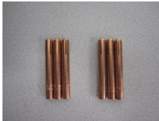
Part Number # 99901032 Three 1/8 Collets Part Number # 99901033 Three 5/32 Collets