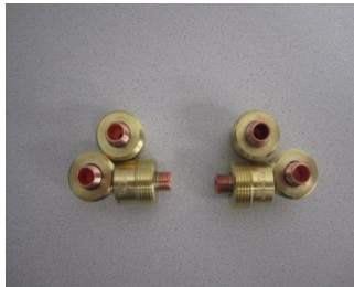
Part Number # 99900526 Three 1/8 Gas Lens Part Number # 99900528 Three 5/32 Gas Lens