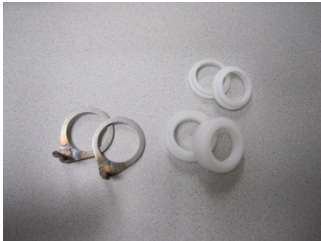
Part Number # 77700632 Two Tip Tig Ring Holder Part Number # 77700214 Two Ring Insulators Part Number # 77700605 Two Nozzle Insulators