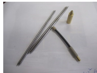
Two 1.5% Lanthanum 1/8" DIA 7" Long PC 25 Deg Taper Two 1.5% Lanthanum 5/32" DIA 7" Long PC 25 Deg Taper Part Number # 77700569 One Inlet Guide Tube w/ Guide Bearing