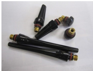
Part Number # 77700240 Two Small Back Caps Part Number # 77700241 Two Medium Back Caps Part Number # 77700242 Two Large Back Caps