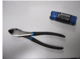
(20) Part Number # 069-67-123 One Heavy Duty Diag Side Cutters (21) Part Number # J4974CG One Fold Hex Key 1.5mm – 6.0mm Allen