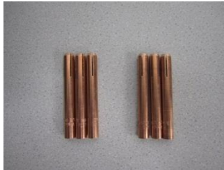
PN # 99901032 Three 1/8 Collets PN # 99901033 Three 5/32 Collets