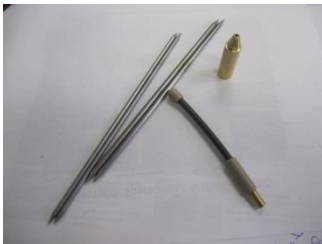
TL08-7000-01-D 1/8" DIA 7" Long PC 25 Deg Taper TL08-7000-01-D 5/32" DIA 7" Long PC 25 Deg Taper PN # 777005691 TIP TIG OUTLET BRASS GUIDE PN # 777005692 TIP TIG TEFLON OUTLET TUBE