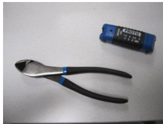
PN # J4974CG One Fold Hex Key 1.5mm – 6.0mm Allen PN # 069-67-123 One Heavy Duty Side Cutters