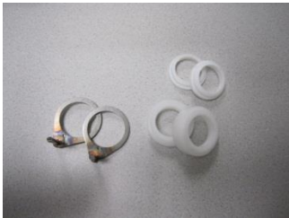
PN # 77700632 Two Tip Tig Ring Holder PN # 77700214 Two Ring Insulators PN # 77700605 Two Nozzle Insulators