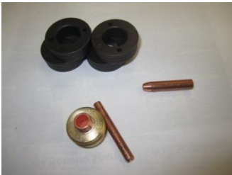
PN # 88807060 Four 1.0 1.2mm Drive Rolls PN #77700538 .068 Tip PN # 99900524 3/32 Gas Lens PN # 99901031 3/32 Collets