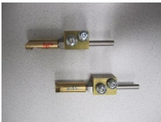
PN # 77700685 One 42 Deg Tip Holder for PIPE PN # 77700686 One 39 Deg Tip Holder for PLATE